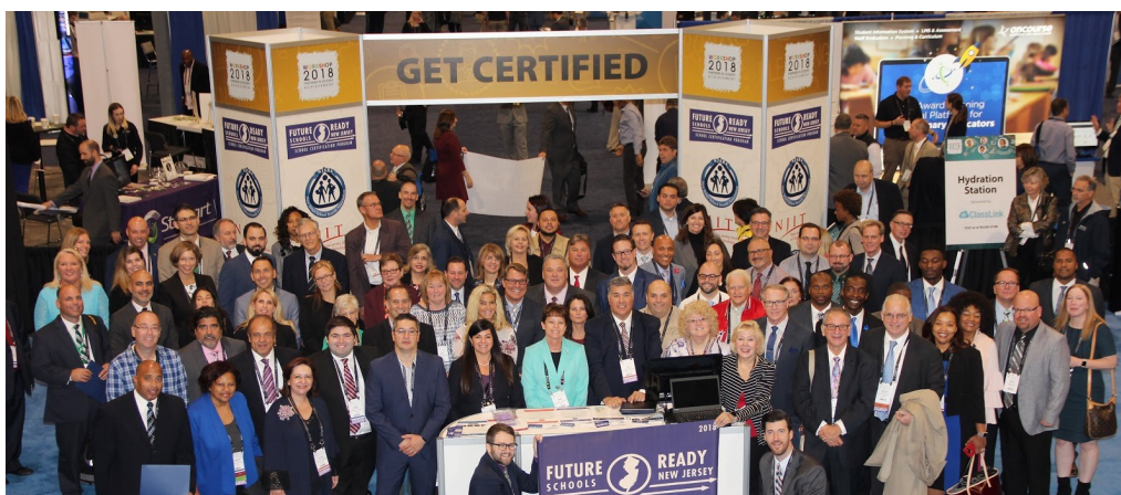
2019 Certified School District Representatives at NJSBA's Workshop 2018

All submitters should remember that regardless of your final certification status, it is the journey of self-reflection, self-assessment, inclusive collaboration, and growth as a school and district that are at the heart of this process!