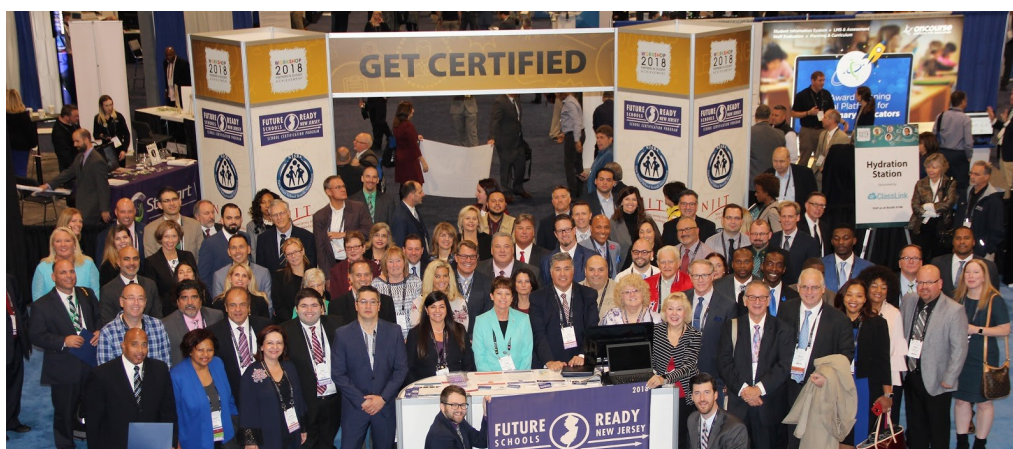
2019 Certified School District Representatives at NJSBA's Workshop 2018

All submitters should remember that regardless of your final certification status, it is the journey of self-reflection, self-assessment, inclusive collaboration, and growth as a school and district that are at the heart of this process!